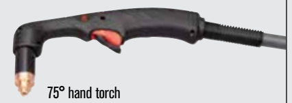
75° hand torch

(for more torch options, see www.hypertherm.com )