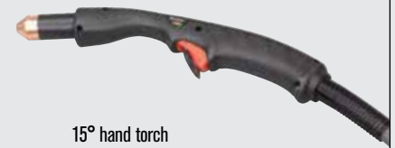
15° hand torch